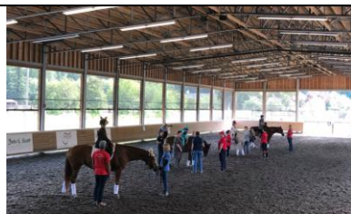
Judging costume contest at Little Bit RT.