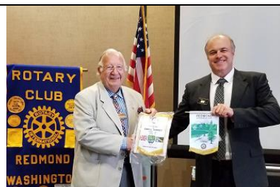
Visiting Rotarian from England