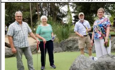
Fun times at Eastside Rotary Putt-putt Golf tournament