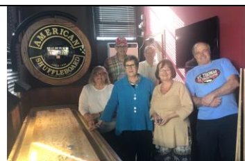
2nd Shuffleboard Tournament.